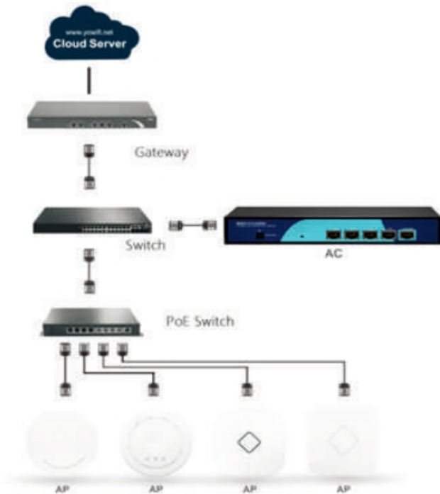
Working diagram as AC Controller